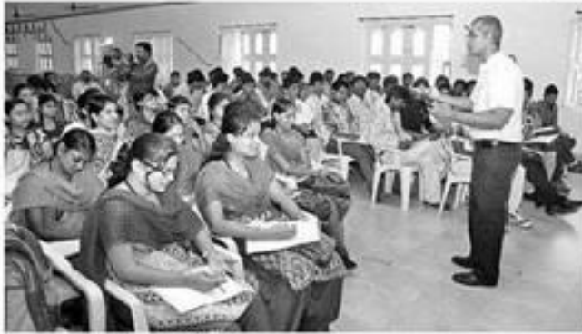
మిట్టిలో జరిగిన ఇంజనీరింగ్ విద్యార్థుల శిక్షణ కార్యక్రమంలో సూచనలిస్తున్న శిక్షకులు