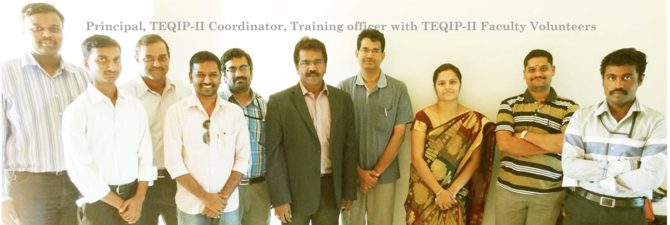
Principal, TEQIP-II Coordinator, Training officer with TEQIP-II Faculty Volunteers

MITS College organized 5 day Aptitude Training Programme for Final year students by Prometis Pvt. Ltd., Bangalore